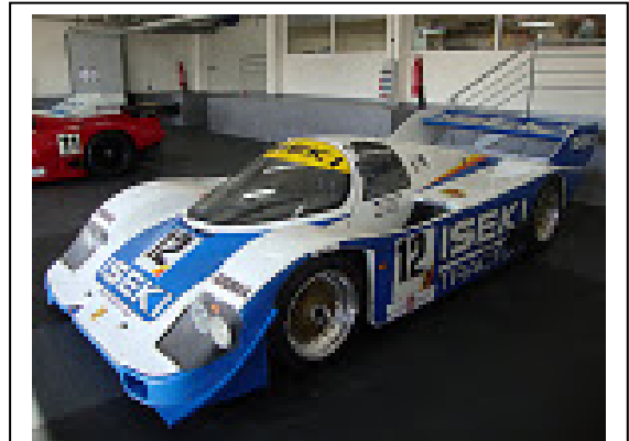
Porsche 956 (above) and 962 (below)