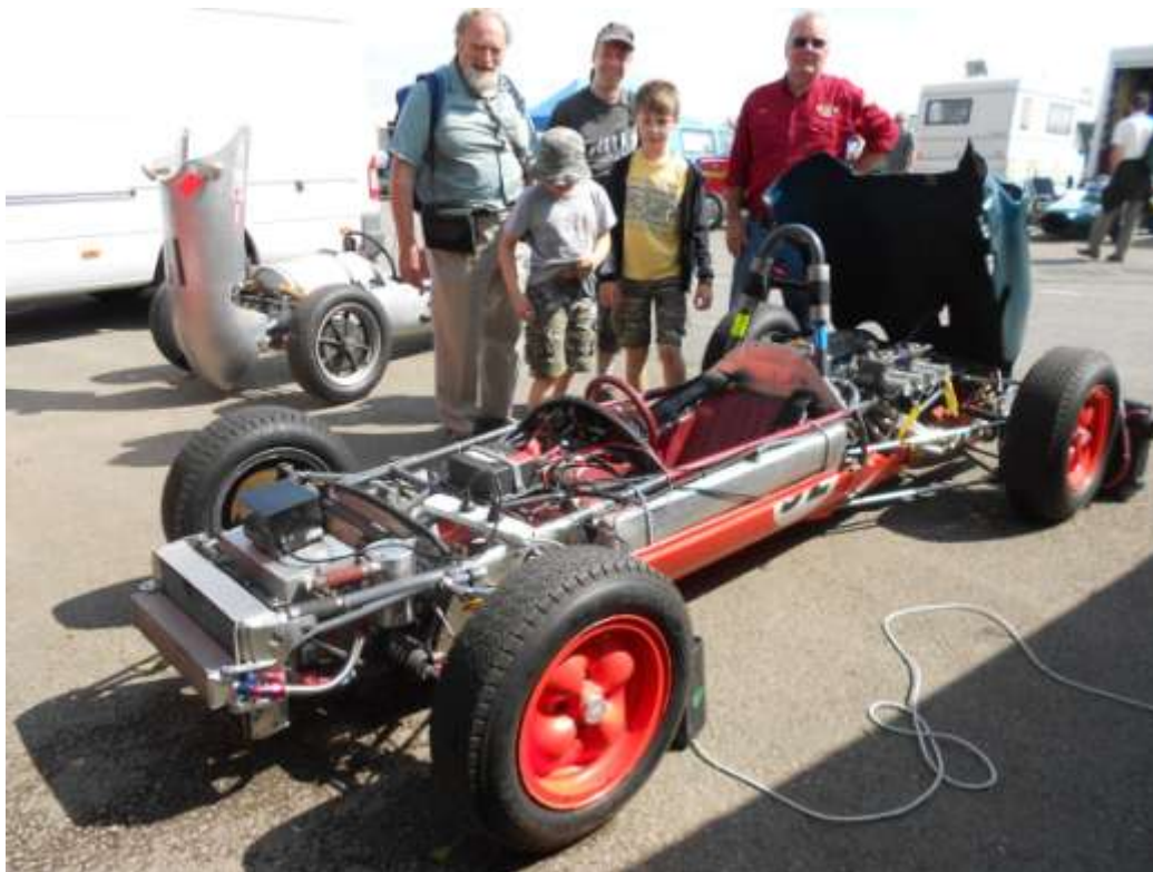
Thallon Family Cheer Squad at Croft