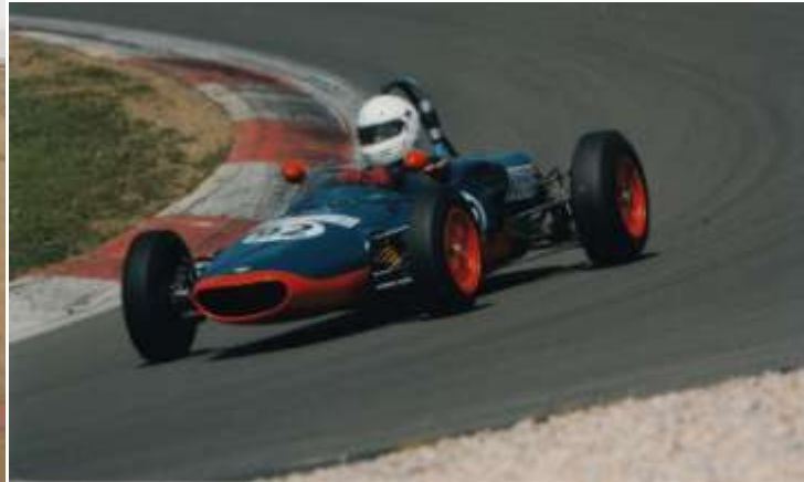
On the Track at Nurburging