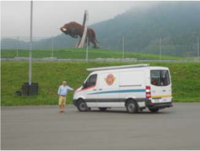
The Red Bull