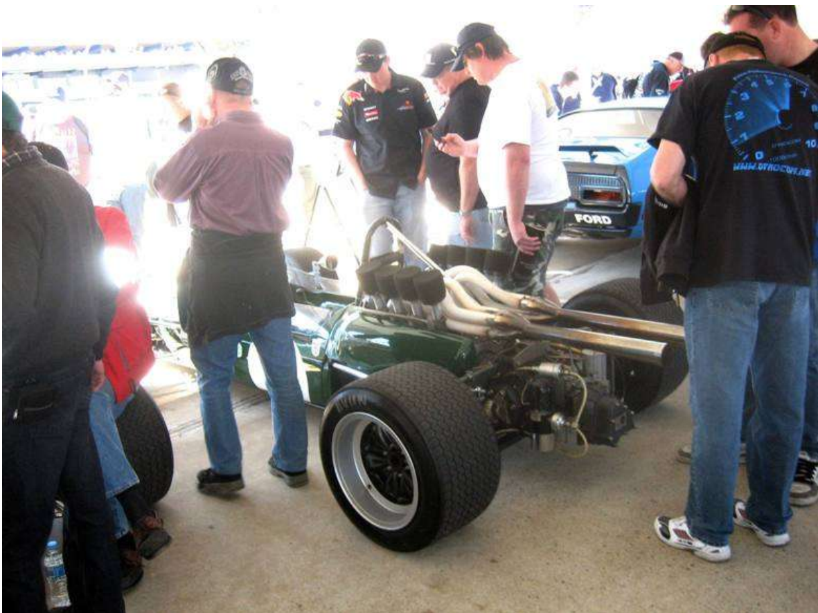
Sir Jack's BT24 Repco Brabham attracted a lot of attention amongst the V8 fans of another era.