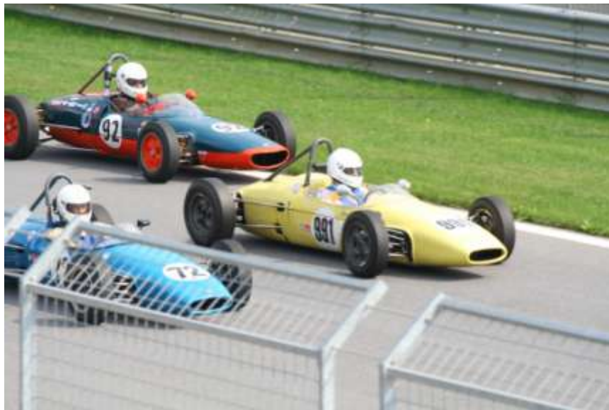
Pole Sitter 991 stopped at the start