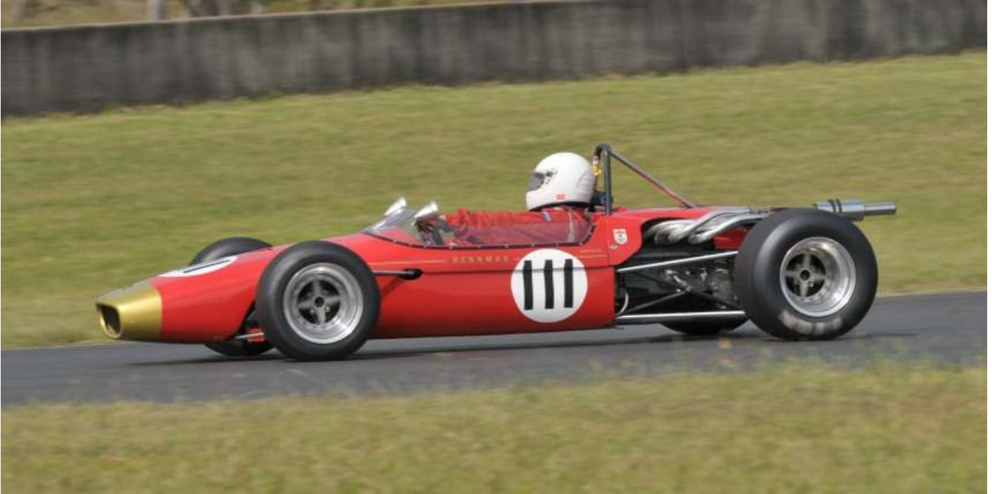
A Peter Schell photo of the Rennmax competing in the 2008 Tasman Revival race Eastern Creek.