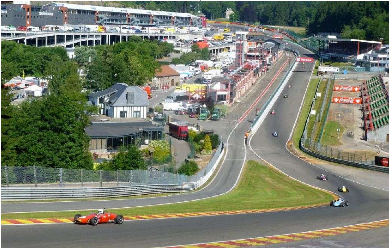
Peter Boel on the run out of Eau Rouge - And yes I did have a go at Eau Rouge flat chat in my FJ but only once!!!

Spa-Francorchamps was without doubt the most spectacular circuit we visited. I've always thought of Belgium being flat and boring but it has some serious mountains on its eastern border. The sign posting to the circuit is seriously deficient and with our GPS messing us about we spent several hours 'exploring' these mountains before finding our way in. Not easy on the narrow steep roads in a motorhome with trailer!!!! We got to know Spa town really well as no matter what road we took to Francorchamps we ended up back in the Spa main street where a festival had the traffic at a standstill.