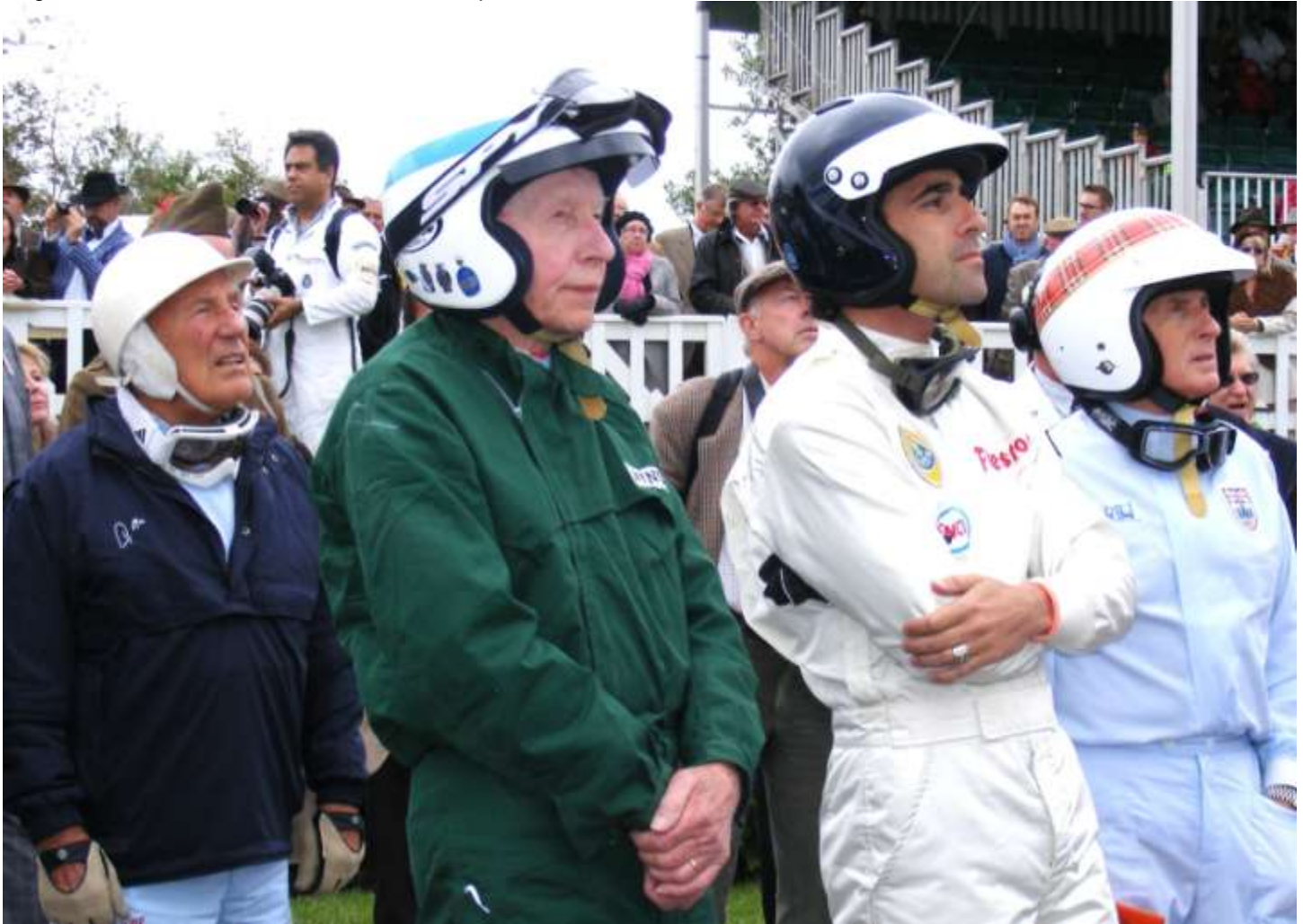
The driver's briefing is a veritable who's who of motor racing.

To recognise the recent restoration of the original Race Control Building near the start line, a time capsule was buried by Lord March containing various things such as Emanuele Pirro's 2006 Le Mans-winning gloves, driving shoes worn by Jochen Mass to win Le Mans in 1989 and autographed photos from Sir Stirling Moss. Drawings, plans etc. were all included together with donated local artwork. Three competition placegetters of UK car magazine contests were able to chose some personal items that were included as well.