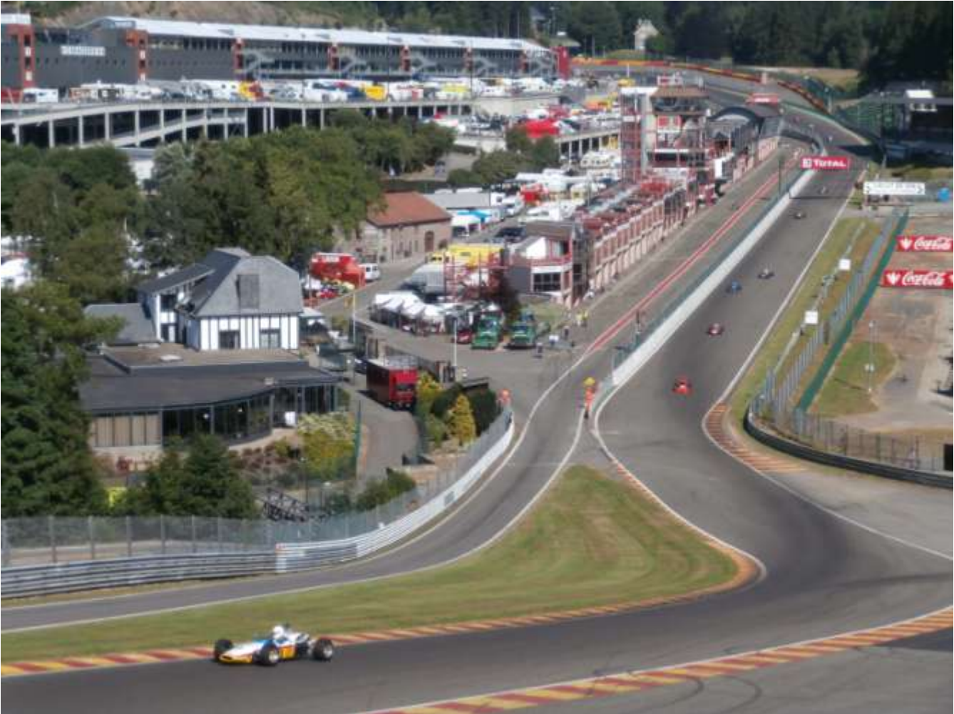
Neil at eau rouge in the Macon

For those that have not yet been to Spa the journey involves a ferry trip to France then a reasonable drive across Belgium to the Arden to Francorchamps. The drive across Belgium was on fantastic roads and we finally hit the mountains about an hour before Spa. We had programmed in Spa into the GPS but unlike England the circuit is badly signposted and we finally arrived at the Paddock entry after some additional sightseeing. The track is well laid out with massive pit areas but only half a dozen toilets for the pits. To make things more interesting the doors were propped open so everything was on show which left nothing to the imagination.