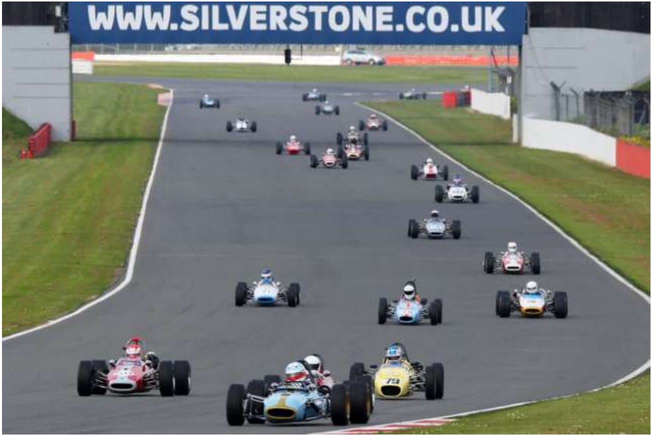
The banner above the track says it all.