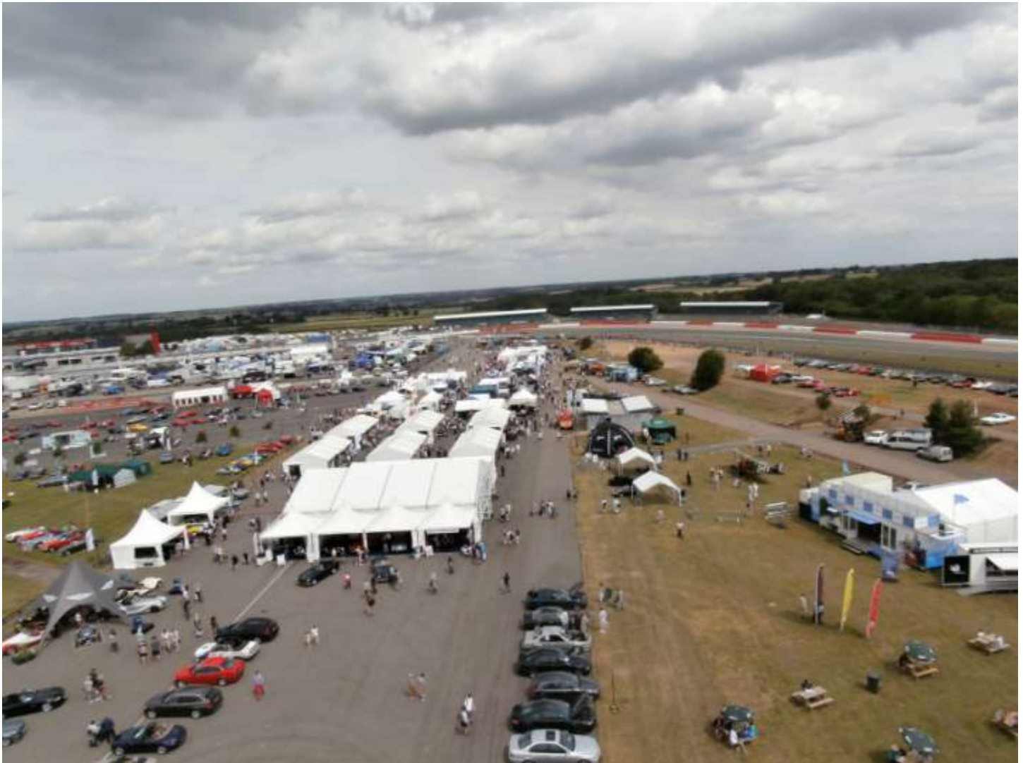
Some of the trade displays at Silverstone

On Sunday I was able to have a reasonable run. On reflection I found that Silverstone although it is a F1 circuit has in my view no soul. It is big and commercial to have practice on the Thursday it would have cost $500 for two 20 minute sessions.